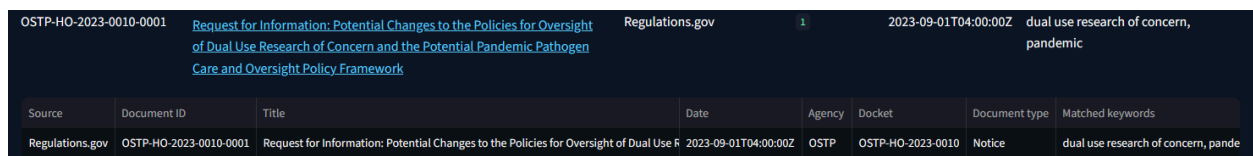
Figure 2: Detailed view of a row of the Biosecurity Policy Dashboard.

Figure 2 demonstrates the dashboard's ability to display more detailed information about a record. The detailed information is displayed upon a click of an underlined title.